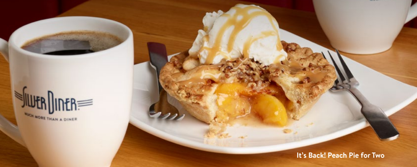
It's Back! Peach Pie for Two

From our apple pie to cheesecake, these traditional desserts with modern twists are perfect to share.